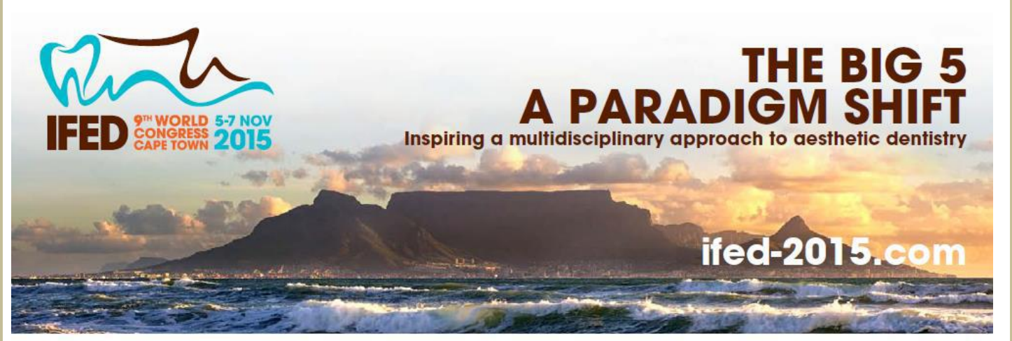
HOSTED BY THE SOUTH AFRICAN ACADEMY OF AESTHETIC DENTISTRY AND THE INTERNATIONAL FEDERATION OF ESTHETIC DENTISTRY

Remember that your membership of IFED entitles you to a discount on registration fee. Please visit the Facebook page at IFED-2015 for full Scientific programme, Hotels and full Social Attractions.